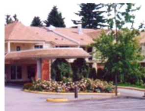
Carl Mortensen Manor