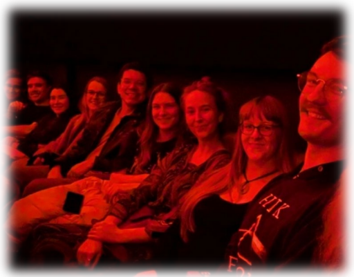
Col/Car Group at the Dome for Pink Floyd