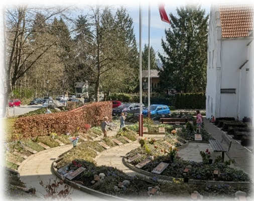
Hunting for Easter Eggs